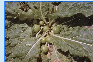
mandrake ( Mandragora officinarum )