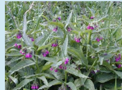
comfrey ( Symphytum officinale )