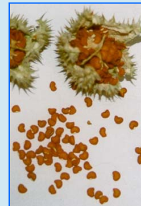
thornapple ( Datura stramonium )